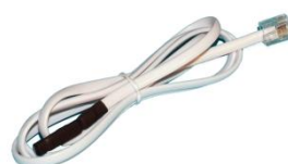
Temp-1Wire 1m 600 242