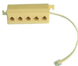
Poseidon T-Box 600 040