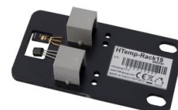
HTemp-Rack19 600 330