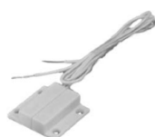
Door Contact 600 119