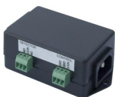
PowerEgg 600 237