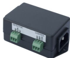
PowerEgg 600 237