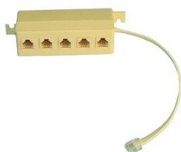
Poseidon T-Box 600 040