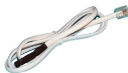
Temp-1Wire 1m 600 242